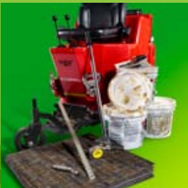
Tools and products required to install using traditional adhesives