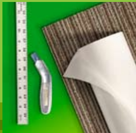
Tools and products required to install using PermaLink adhesive tiles.